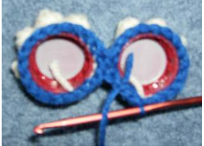
Rnd 8) Ch 1, sc in 1<sup>st</sup> 3 sts, hdc dec, sc in next 17 sts, hdc dec, sc in last 14 sts. Join. (36) ***Stuff legs now if not using lids!***

Starting body~ Rnd 7) Ch 1, sc in first 4 st on 2<sup>nd</sup> foot, then sc in 2<sup>nd</sup> st to the right of joining on 1<sup>st</sup> foot, Sc in next 17 sts on this foot, then sc in same st as 1<sup>st</sup> st made on this foot, Sc in same st as last st made on 2<sup>nd</sup> foot, sc in last 14 sts. Join.(38)