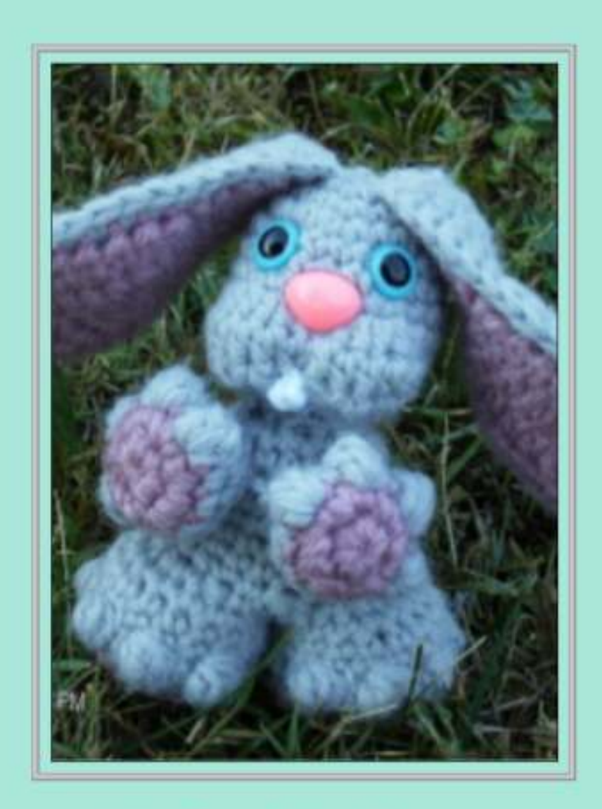
Big Feet the Bunny